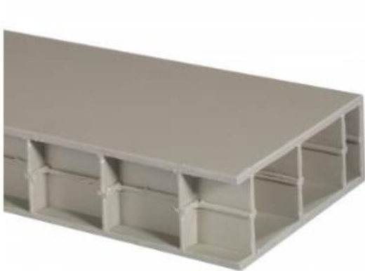
Figure 4.1 - Multipower panel 50/50

Multipower panels are all-round heavy duty panels with an overall thickness of 50 mm and a square cellular core structure with 50 x 50 mm cells. A simplified technical drawing of the panel including nominal values and standard deviations of the thicknesses is provided in Figure 4.2.